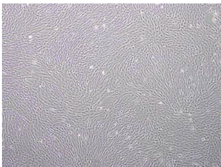
September 05, 2017 ( magnified x 40 )